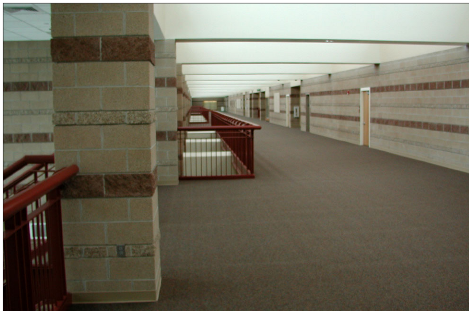
The first floor hallway looking towards the main office.

Please bring the family and join us for this big event.