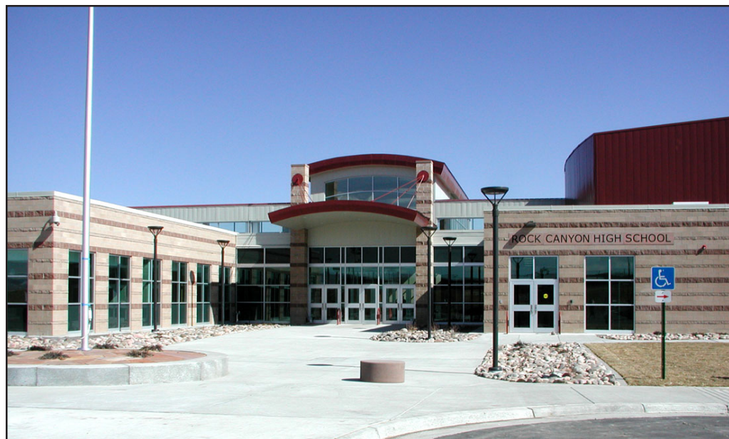
The front entrances of RCHS is inviting and ready for students.

A Newsletter for Parents, Guardians & Community Members of Rock Canyon High School