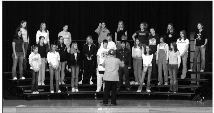
The 9th grade choir practices for the March 2 concert.

Rock Canyon/Rocky Heights first musical production will be performed April 16 and 17 at 7:00 p.m. in the Rocky Heights Commons. This musical comedy is about a group of high school students producing a school musical. Don't miss it!