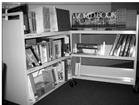
The beginnings of the RCHS Library Media Center are shown in these photographs. We need your help in filling the shelves of the library.