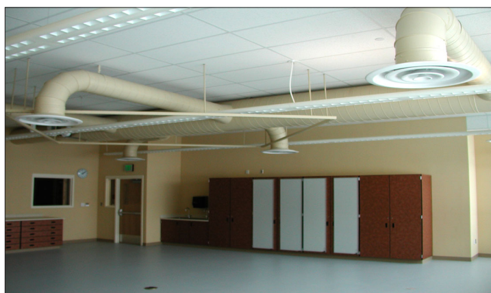
TOP: Offices and classrooms alike come with lots of built-in storage, along with full wiring for the Internet.