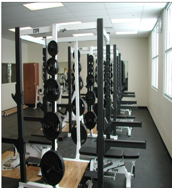
The state-of-the-art weight room, from two angles. The weight training facility will provide all students with opportunities to excel in physical education and athletics.